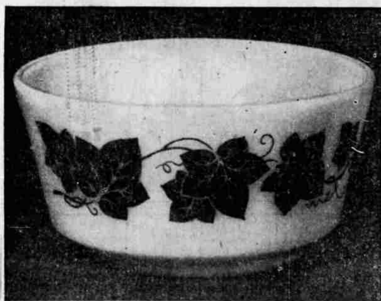
IVY UTILITY BOWL (actual size). Measures 5" across! Holds 16-ounces! Has dozens of uses!

Just think! Nothing to clip or send in! Not an extra penny to spend! Simply buy a 25-lb. sack of Sperry Drifted Snow "Home-Perfected" Enriched Flour and your grocer will give you two of these lovely "milk glass" bowls! Made of attractive platonite! Decorated with colorful green ivy leaves. Wonderful for mixing and refrigerator use. And for serving cereals, soup, fruit or puddings. You'll love them, want many of them, use them often every day.