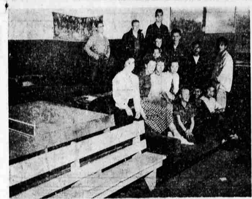
CHILOQUIN YOUTH ENJOY the popular, newly painted Youth Center, center of nearly all young people's activities in the town. The current budget estimate for the coming year is only $695, to be included in the Community Chest budget. Chiloquin residents are urged to contribute generously.