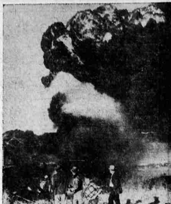
FIRE TRAPS THREE — A spectacular ball of flame rises from the engine room at Winston coal mine near Winston, Mo., trapping three miners in the 465-foot shaft. Shortly after this picture was made the fire was brought under control and the miners brought safely to the surface through an air shaft. Generating and diesel equipment at the mine were destroyed.

NEW YORK (AP)—Former President Herbert Hoover issued a statement early today saying, "The American people have ordered a change in the administration of our government but the hour of victory for our cause is no time for either recrimination or exultation." He added: "The problems before us are more difficult than were even debated in this campaign. The majority of our people are giving their faith of solution of our problems into the hands of Gen. Eisenhower and his friends. I am sure the whole American people pray the Almighty for his success in the great task now before him."