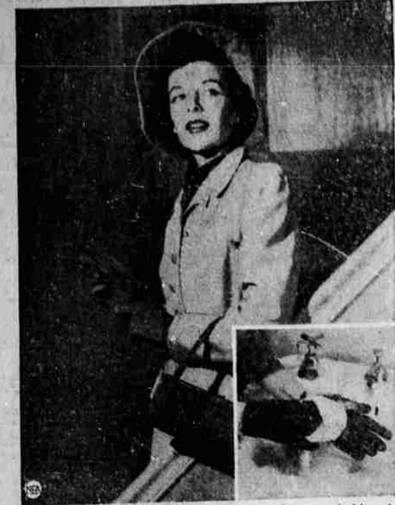
CHOOSING fashion-right accessories with a washable air assures a chic easy-to-care-for appearance (above). A gentle glove-washing technique for tweedy corduroy with knit nylon gloves requires that you put the gloves on, immerse them in lukewarm suds, and then gently rub more suds on soiled spots with a soaped-up washcloth (insert).