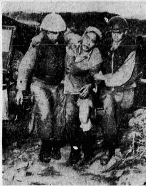
SHOW OF MERCY — A wounded Chinese prisoner of war is helped into a bunker in the French Battalion area near the front lines by two French Infantrymen of the U.N. forces.

The War Office agreed to merge the women's unit with the university men's training corps.