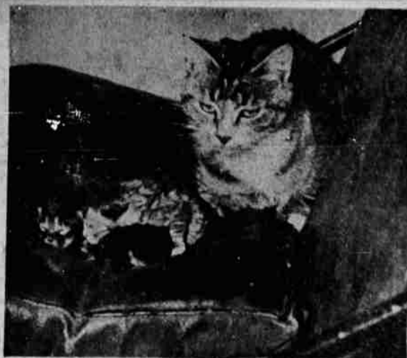
'AIRBORN'—Cessna, the air-minded cat, poses with her latest edition of flying kittens in the cockpit of a plane at Municipal Airport.