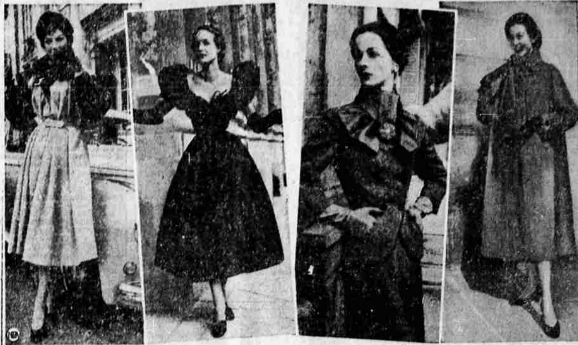
HERE IS THE LOOK of fall and winter fashion from the top designers in Paris. Fur trimming, a favorite for winter, is used (left) by Jacques Heim for this heavy, mustard-yellow wool coat. The trim in dark brown beaver, is used for the hat, too. Black silk faille (left center) by Christian Dior has stiffened bertha outlining deep decollete. It's worn with a black velvet