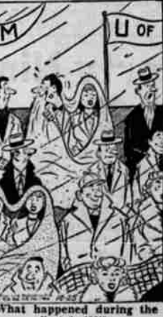
What happened during the first half?