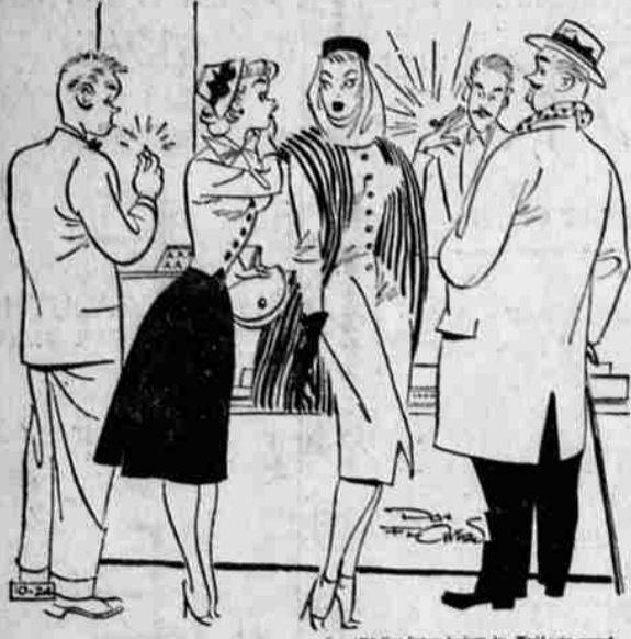
"Pet—Would you consider trading fiancés?"