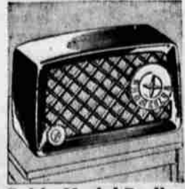
Table Model Radios Compare Sears Low Price Now Only..... 13.95 Light, handy set, ideal for kitchen or bedroom. Direct tuning, 4-in. speaker, brown or ivory finished metal cabinet.

Children's Phonos With 15 Happy Story Records Silvertone..... 17.95 Not a toy but a real electric phonograph that "be-between-ages" child. Plays all sizes and types of 78 RPM records.