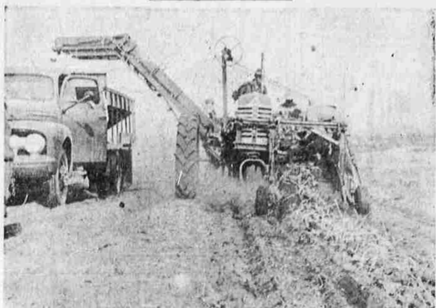
ON BRYANT WILLIAMS' PLACE a Lewis Manufacturing Co. self-propelled bulking rig can pack away between 125 and 140 tons of potatoes per day, replacing between 25 and 30 pickers. It operates with a crew of seven, including cellar-men. There are a dozen of these in use at present, and one is now in use in Baker.