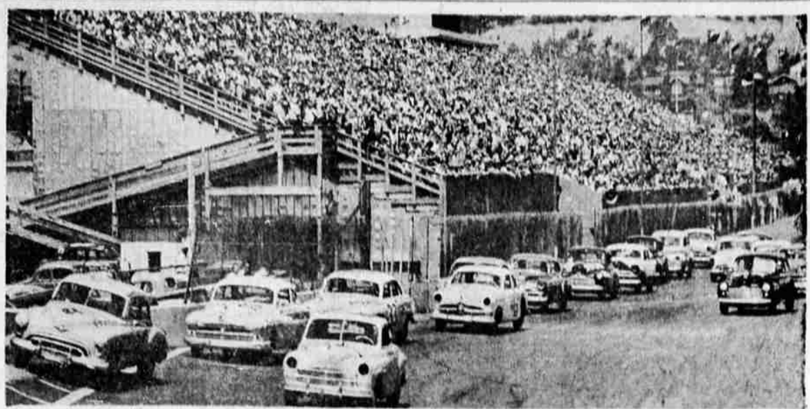
FANS PACK SPEEDWAY for new model stock car race in a recent Oakland Speedway classic. The same thing is expected tomorrow afternoon at the Klamath County Fairgrounds when the American Racing Association presents the first stock car race ever to be held in Klamath Falls. Here the crowd stands to give the drivers a rousing ovation at the start of the race. This sporting event is becoming increasingly popular all over the nation as speed fans get a chance to root for their favorite make of car. Tomorrow's time trials start at 12:30 p.m., the 100 mile event at 2.

Statistics: Net yards rushing 213 85 Net yards passing 0 0 Total net yardage 213 85 First downs rushing 12 3 First downs passing 0 0 First downs total 12 3 Total first downs 12 4 Passes completed 3 4 Passes intercepted 1 0 Number punts 7 7 Punt average 31 35.4 Number penalties 2 2 Yards penalties 23 22 Touchdowns 1 0 Conversions 1 0 Field goals 0 0 Score 7 0 Score by quarters: Klamath 0 0 7 0 Medford 0 0 0 0