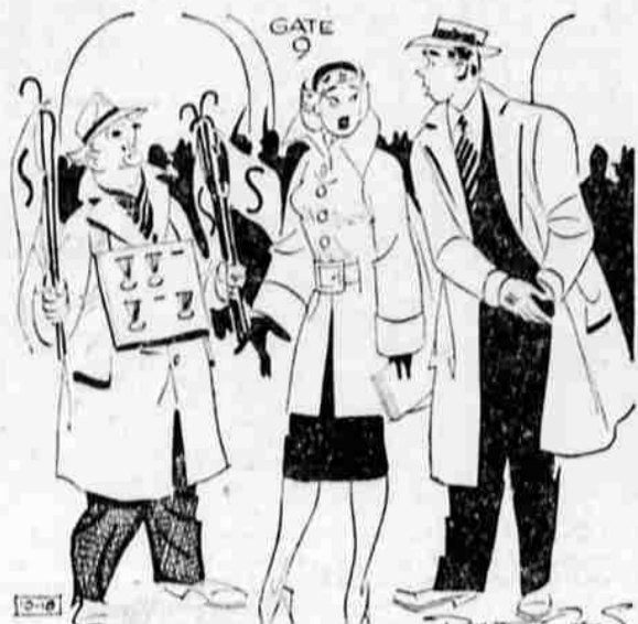
"Couldn't we change our seats? He has only State pennants left."