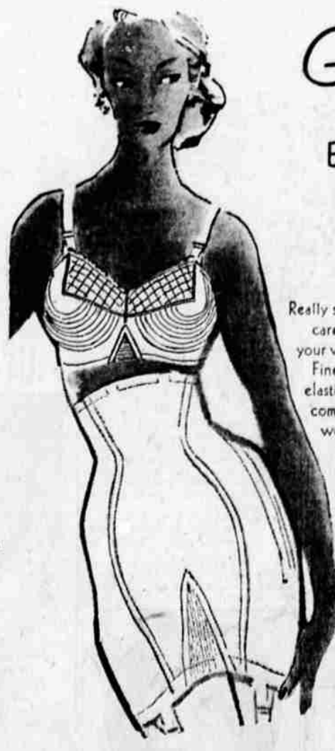
14" length with zipper, 6 garters. White, Pink. Or 16" at $11.00