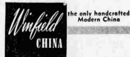
the only handcrafted Modern China