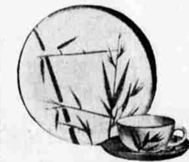
Bamboo shades of subtle green on white background.

* 34-piece service includes 8 dinner plates, 8 bread and butters, 8 cups, 8 saucers, 1 7/2 x 11 platter and one round vegetable. You can add to your set from our complete open-stock selection!