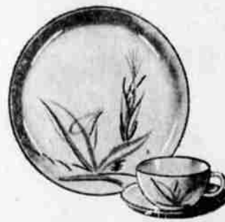
Dragon Flower brilliant design... and decorated in delicate pink, brown and beige.

makes it easy to give Winfield China for Christmas!