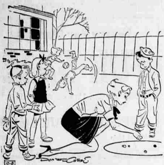
"Miss Larsen figures if she wins 'em all now she won't have to take 'em away in the classroom."