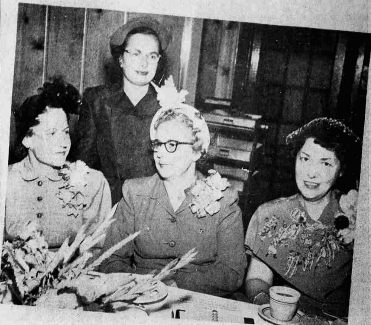
Library Club Luncheon