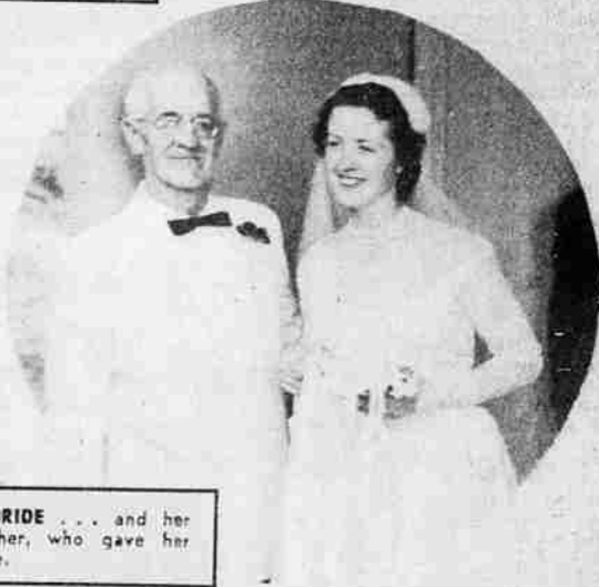
HAPPY BRIDE . . . and her proud father, who gave her in marriage.