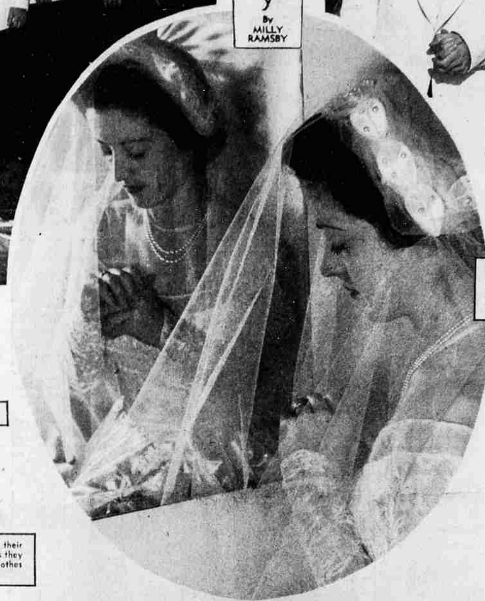
"THIS MOMENT" . . . Quiet contemplation. The bride and her engagement ring. Symbolic of yesterday's pledges and today's vows.