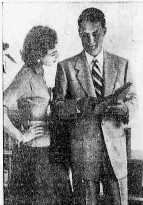
OUTSTANDING! For any social function, an Eagle suit looks better! From $69.50. In Klamath Falls, exclusively at Rudy's, 6th and Main. Adv.