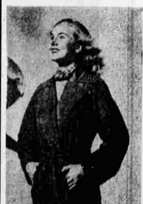
Also in casual jackets and three quarter lengths.

The new initiate has attended the university at Eugene for two summers and her high grades qualified her for membership.