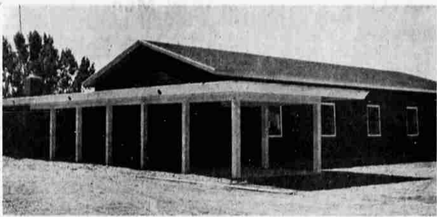
THE NEW PARISH HALL above is to be dedicated Sunday at Merrill's St. Augustine's Church, following dedication at Bonanza of the new St. Francis X. Cabrini Church. A dinner is to be served in the new Parish Hall at 6:30 p.m., Sunday. Tickets are being sold by the Young Peoples Club.