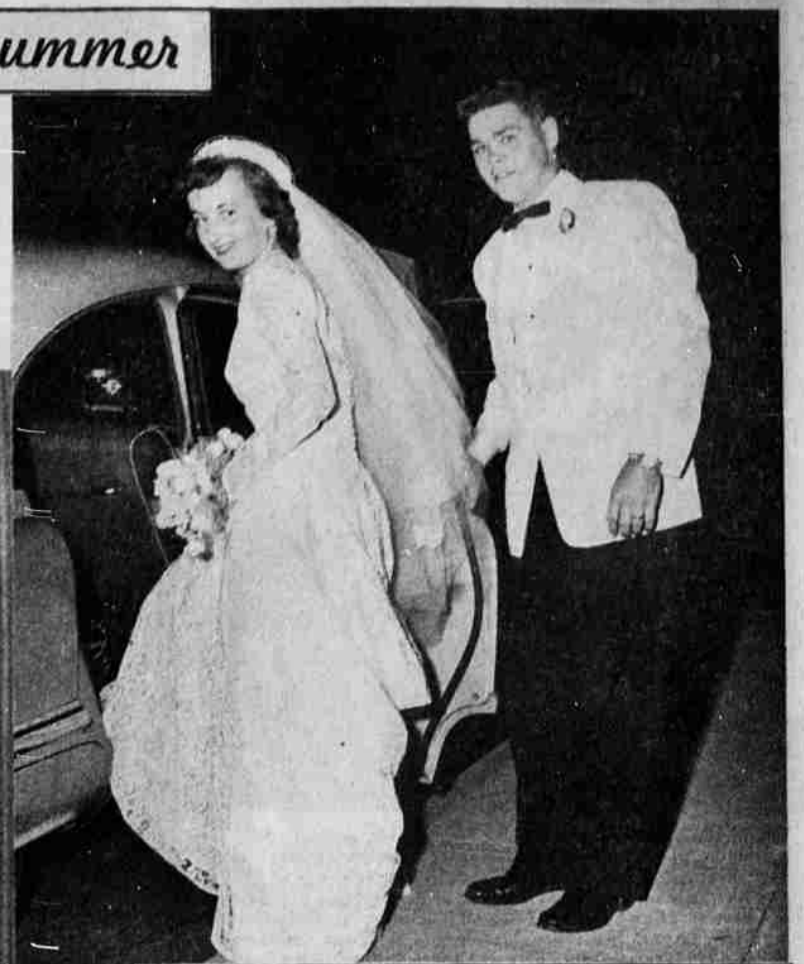
LEAVING THE CHURCH . . . for the reception at the Pelican Party Room, the happy couple pause briefly for the photographer.