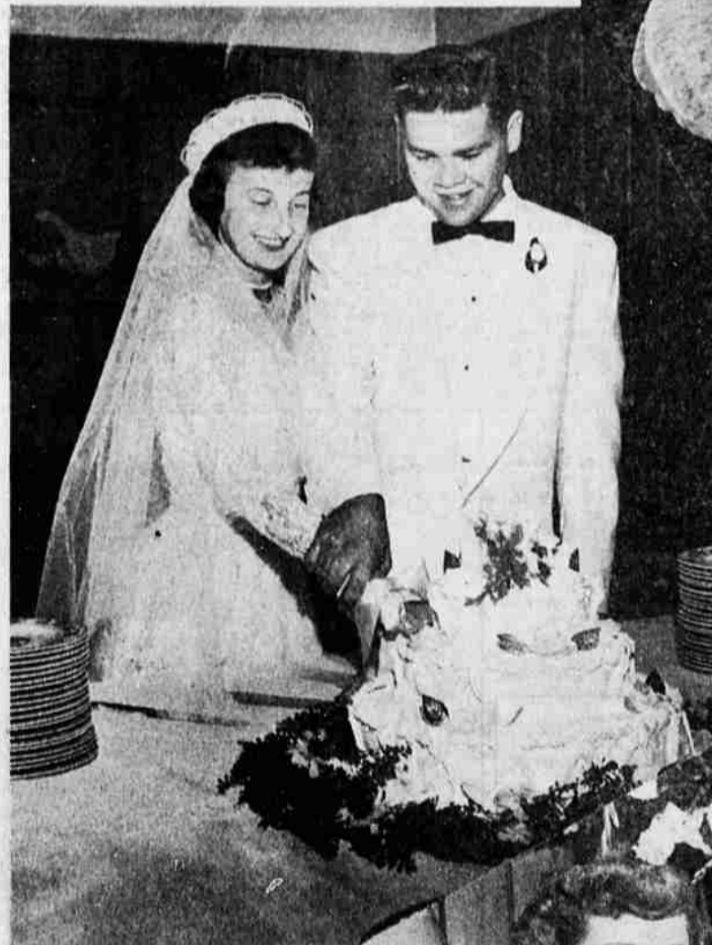
AT THE RECEPTION . . . in the Pelican Party Room, the "just weds" cut their wedding cake.