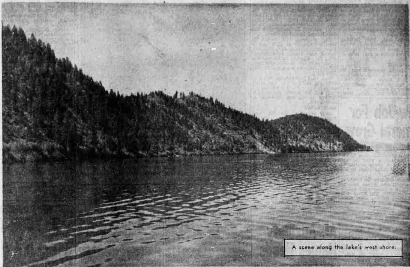
A scene along the lake's west shore.