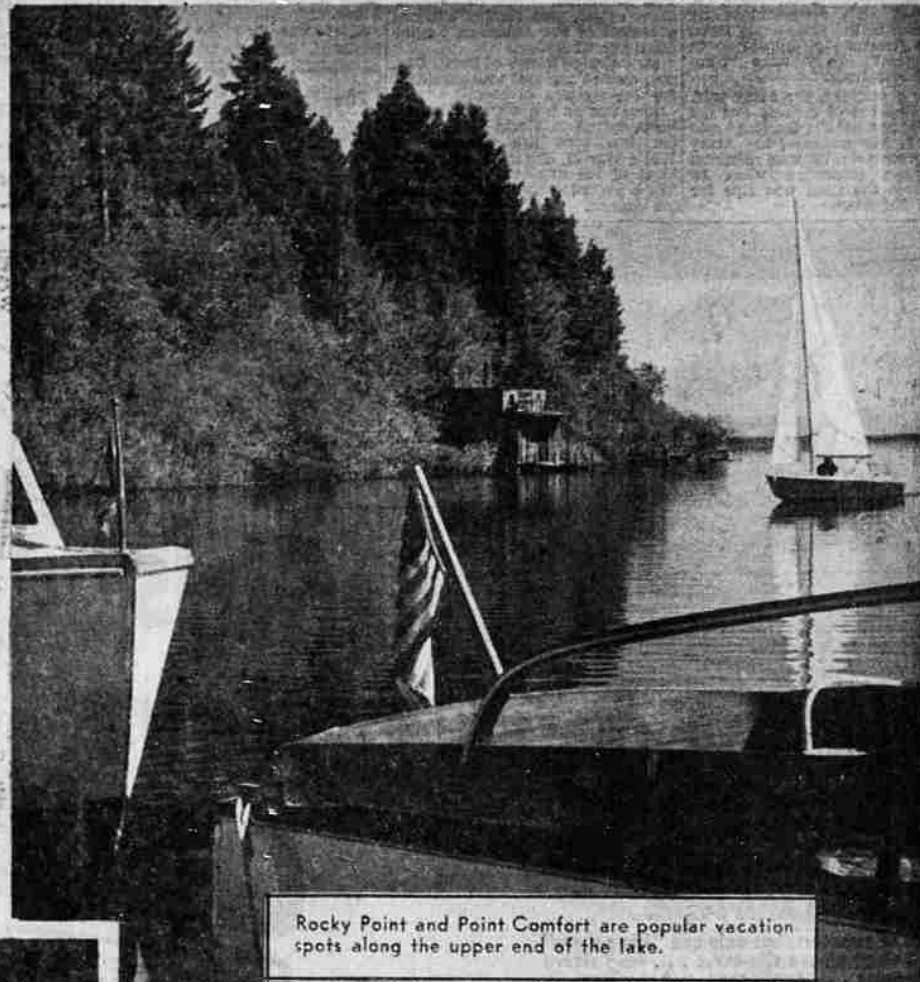
Rocky Point and Point Comfort are popular vacation spots along the upper end of the lake.

This largest natural fresh water lake west of the Rockies holds vast possibilities to become one of the nation's top recreation spots. The lake has a 94-mile shoreline. Pictures on this page were taken during a two-day tour of the lake aboard Fred Fleet's cabin cruiser.