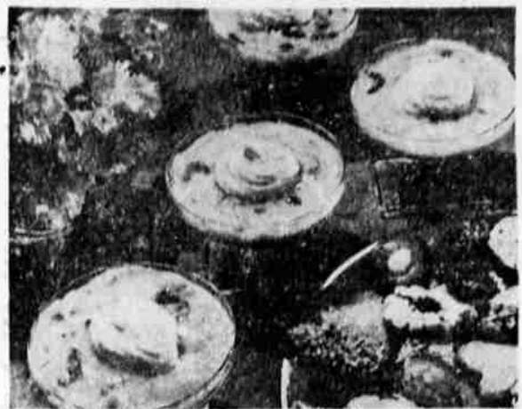
INSTANT PUDDING gets around. We show it here, vanilla flavor, teamed with chopped nuts, raisins and maraschino cherries. It adds up to a delicious Tutti Frutti Pudding. Serve with whipped cream for an extra touch.