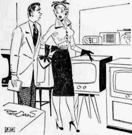
And how many days' free trial on THIS one?"