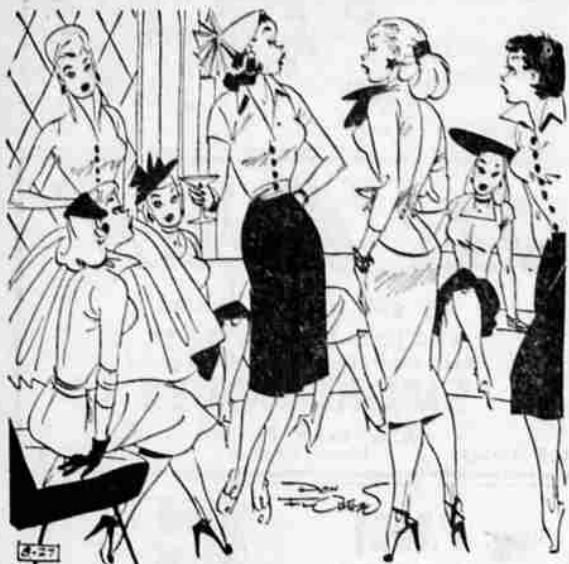
"Now that we're all here, there's nobody to talk about."