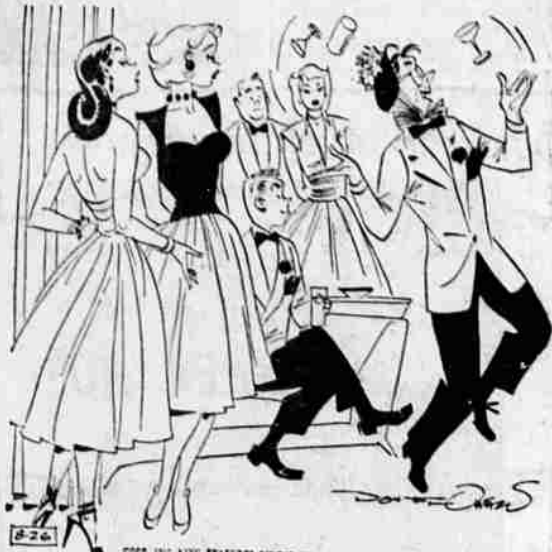
"You're putting up with a lot of buffoonery just to be engaged to two million dollars!"