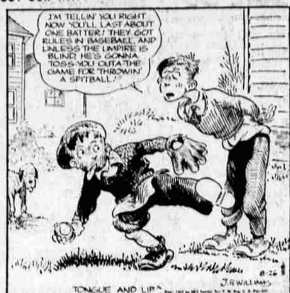
TONGUE AND LIP