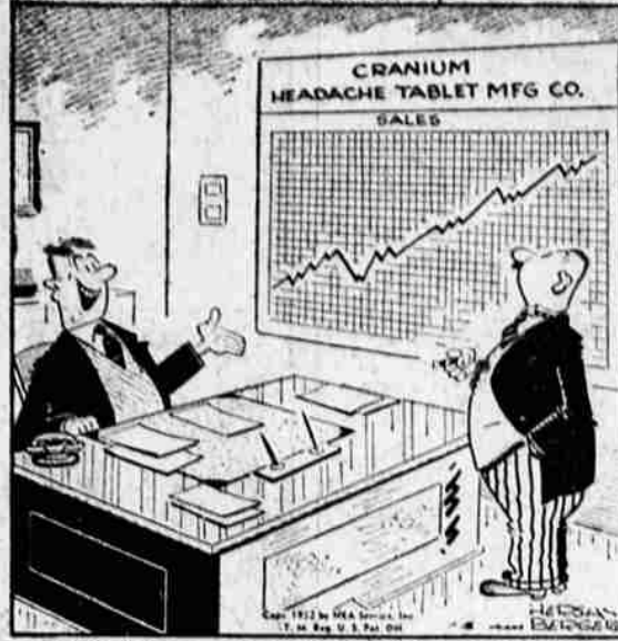
"Thank heavens for a lively political campaign!"