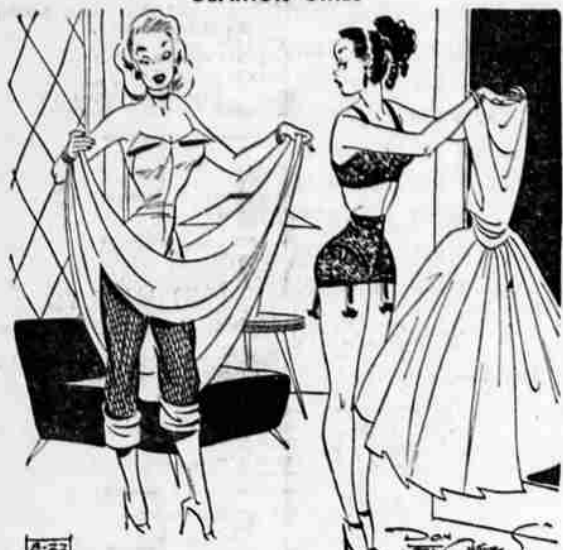
And just in case it turns into a square dance...