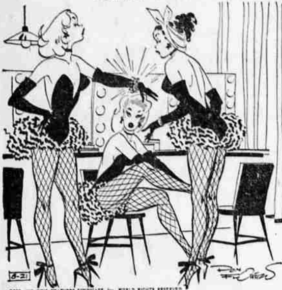
"It pays to have a birthday once in a while."