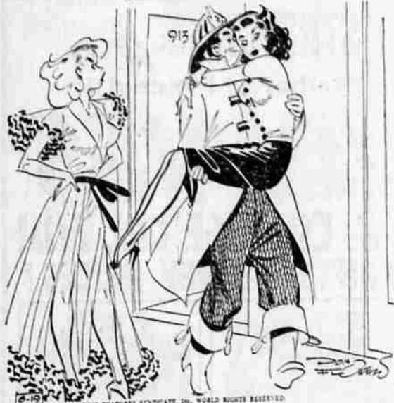
"I'm getting suspicious... three false alarms in one week!"