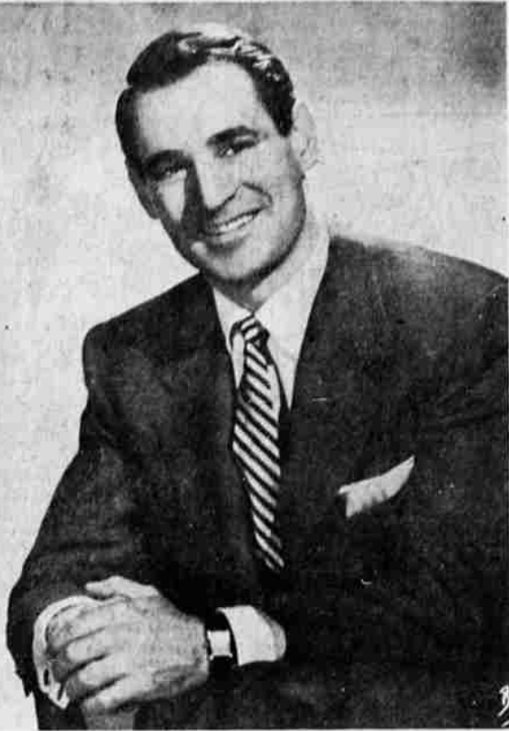
RAY ANTHONY (above) is bringing his 19-piece orchestra and vocalists here for a dance at the Armory tomorrow night. Anthony's combine is currently ranked the nation's No. 1 band. He has set two attendance records this year at the Hollywood Palladium.