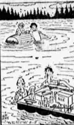
"Well, that's the beer and tackle — now the wives!"