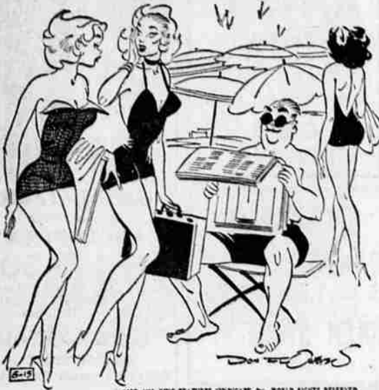
COPE LINE KING FEATURES SYNDICATED BY WORLD RIGHTS RESERVED. "Pst! That's yesterday's paper—he's reading upside down!"