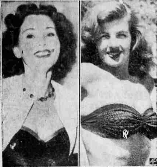
ZSA'S BEING SUED—Actress Corinne Calvet (right), her Gallic ire aroused, has filed a one million dollar slander suit against Zsa Zsa Gabor (left) in Santa Monica, Calif. "Zat Hungarian said I am not French," Miss Calvet protested referring to an interview the curvaceous Corinne said Miss Gabor gave to a Hollywood columnist. La belle Calvet declares she is prepared to prove that she was born in Paris April 30, 1925. In any event, she grew up to be quite a girl.