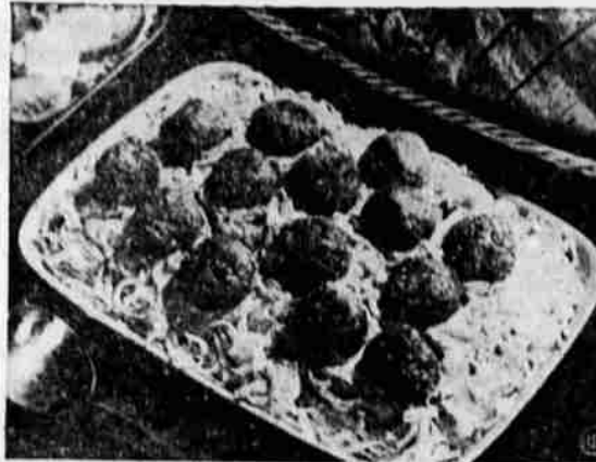
MEAT BALLS of pork and veal are prepared in traditional Hun-garian style, served over noodles and sprinkled with paprika.