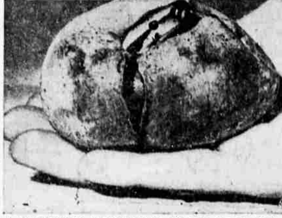
LATEST THING IN SNAKESKIN—Taking a glum first look at the world, this baby python is the seventh to hatch from a dozen eggs delivered by Mama Python at the London Zoo. A foot long at birth, the little fellow will be 15 times as long at maturity.