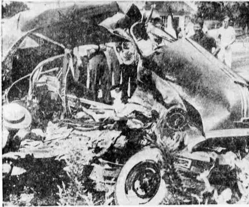
DEATH CAR —This is the wreckage of a late model sedan in which eight persons were killed and a child was injured critically at Midvale, Utah. Police said all eight were believed to be members of the family of John Imada, 67 West Jordan, Utah. A heavy truck loaded with wet sand smashed broadside into the auto. The driver of the truck was not injured.