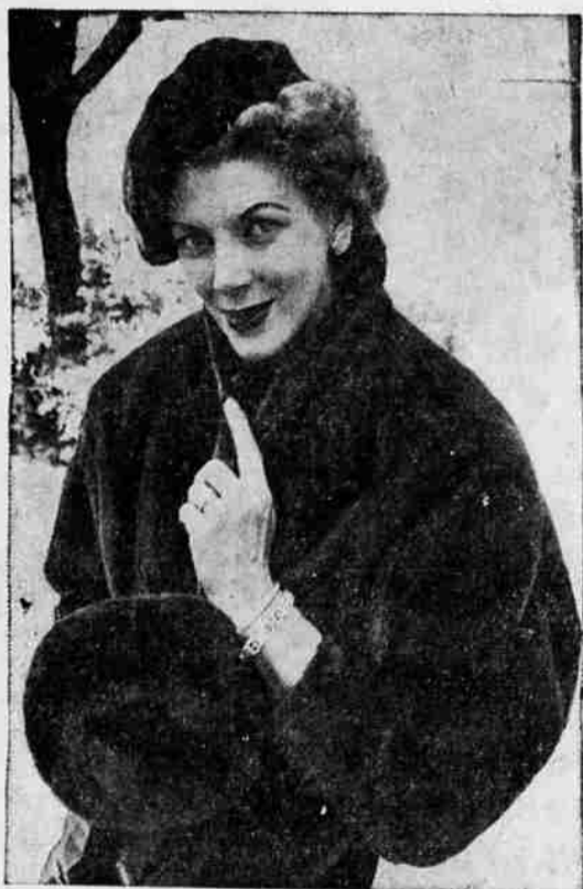
SPENCER JACKET, BERET AND MUFF —all in Nutria, soft and beautiful in texture, makes an ensemble that does multiple duty—jacket can be worn for day or evening, beret and muff can be worn separately with suit. Styled for the budget wardrobe by Esther Dorothy.