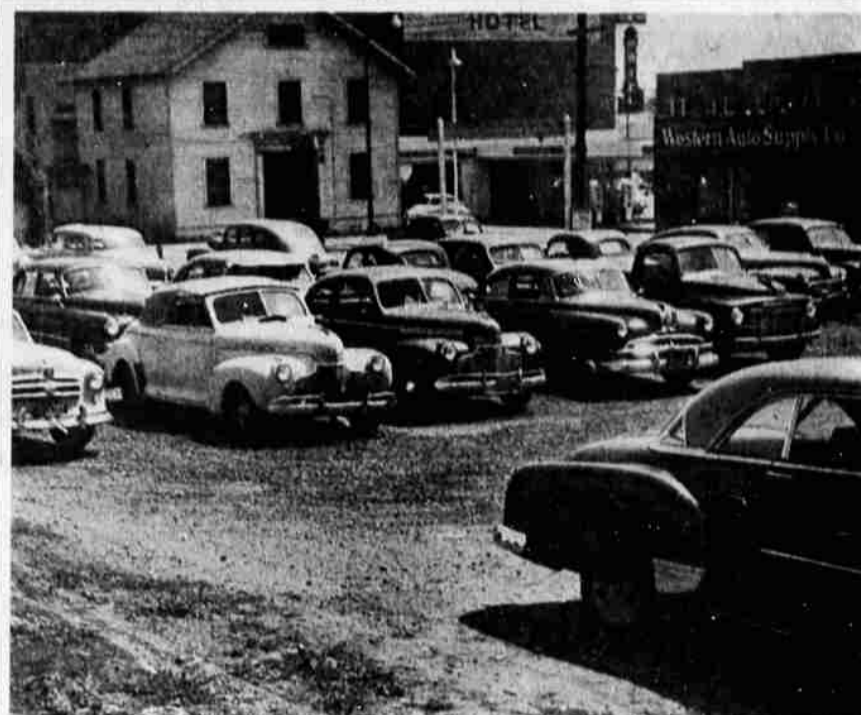
PARKED CARS are a sure sign that shoppers are in the area somewhere. National surveys show that shoppers are unwilling to walk over two blocks from a parking place to do their buying.