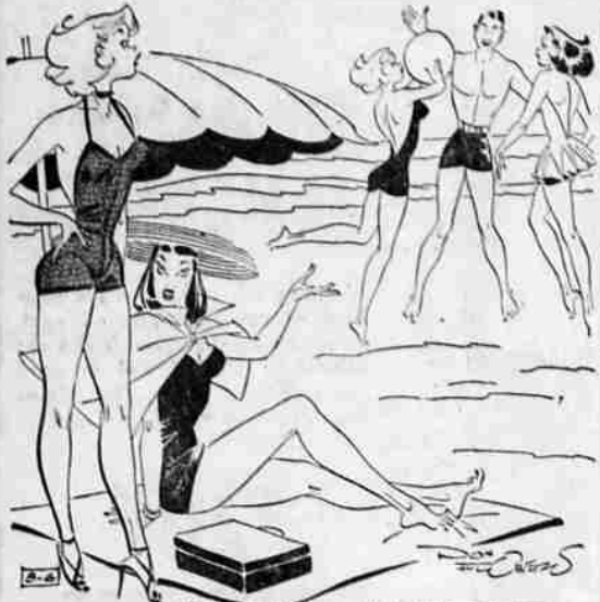
"That's my husband over there. We're taking separate vacations this year."