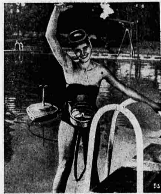
MOTORIZED SWIMMER —German girl in Munich wears a "water horse" propeller linked by cable to motor behind, and able to send her skimming along water at 10 miles an hour.