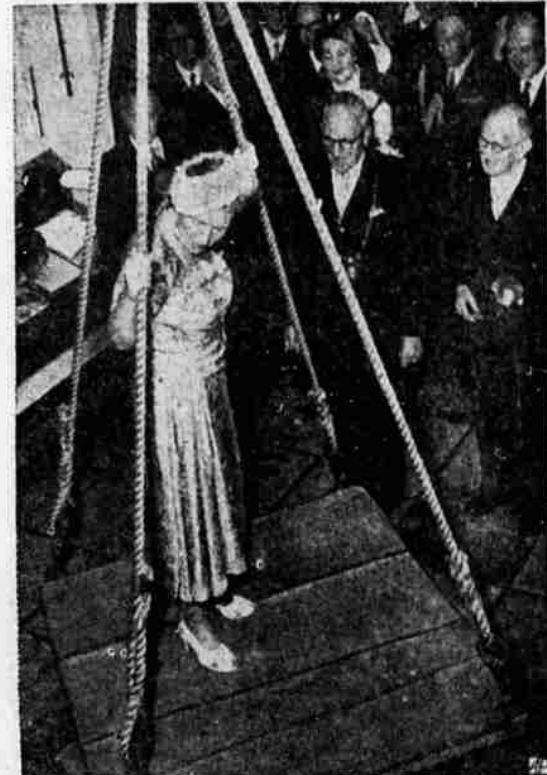
QUEEN ON 'WITCHES' SCALE —Device which decided fate of women suspected of witchcraft is inspected by Dutch Queen Juliana during visit to town of Oudewater.