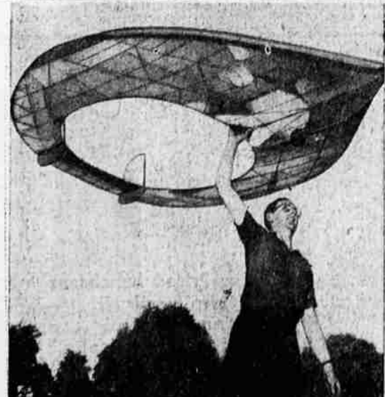
TESTING THE WIND —A member holds aloft a model of a new arrowhead glider under construction at Aachen, Germany, University Aeroclub. Pilot will sit up front at controls.

CLASSIFIED RATES One day ..... per word 4c Three Days ..... per word 11c Week Run ..... per word 20c Month run ..... per word 65c