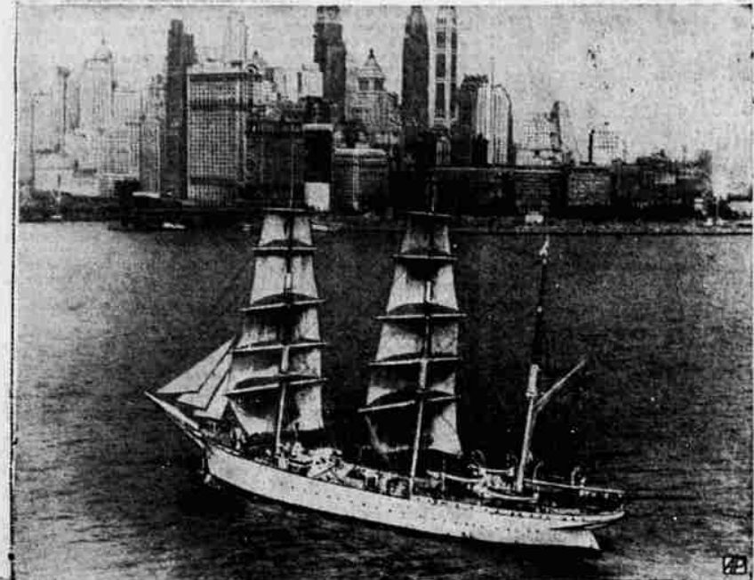
NORSEMEN DISCOVER NEW YORK —The Stataard, a Norwegian barque, with 180 would-be seadogs aboard, moves to New York pier after 36-day voyage from Bergen.