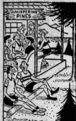
"Don't get much chance to hear the pines, do you?"