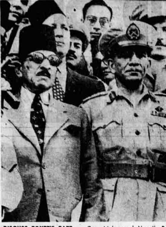
DISCUSS EGYPT'S FATE — Gen. Mohammed Naguib (right), commander-in-chief of Egyptian armed forces, the "strongman" whose coup forced King Farouk to abdicate and flee the country, meets with Premier Aly Maher Pasha (left) in Cairo to discuss the future of Egypt.