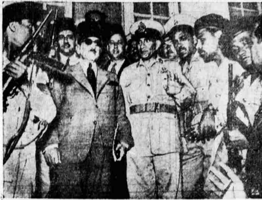
LEADERS IN EGYPTIAN COUP—Lieut. Gen. Mohammed Naguib Bey, Egypt's strong man, and Premier Maher Pasha (left) are surrounded by soldiers and civilians at premier's office in Alexandria, after premier had delivered ultimatum to King Farouk to resign. Farouk later abdicated in favor of his seven-month-old son, Crown Prince Ahmed Fouad and sailed with his family into exile aboard his royal yacht.