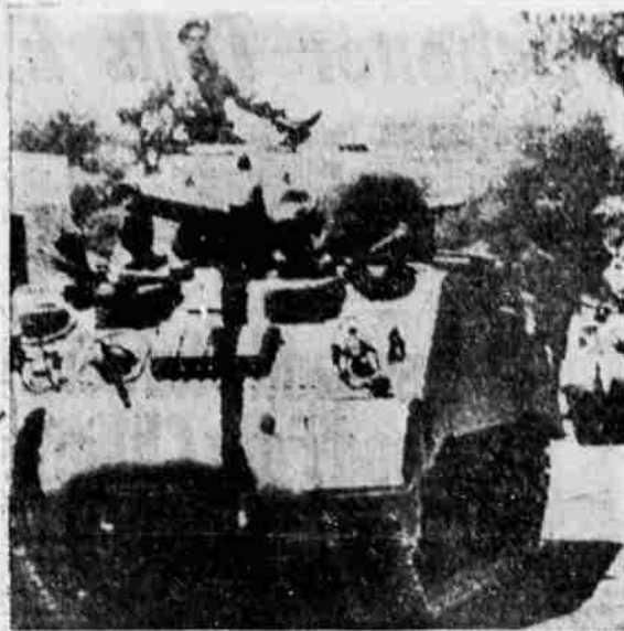
TANKS TAKE OVER —An Egyptian Army tank leads a column of tanks through the streets of Cairo following seizure of the city and ouster of Premier Naguin El Hihaly Pasha. The troops moved into the city at dawn and took over. They also took control of Alexandria, the summer capital where King Farouk and Government leaders are staying.

Western Oregon — Sunny and warm through Tuesday. Considerable night and morning fog and low cloudiness along coast and isolated afternoon thunder showers in southern mountains. Highs and 90 to 100 in interior valleys. Lows Monday night 62 to 62. Winds off coast northwesterly and 15 to 25 miles an hour, increasing locally to 30 to 35 miles an hour during afternoons. Eastern Oregon — Sunny through Tuesday. Isolated afternoon thunder showers in mountain areas. Little change in temperature with highs 85 to 92. Lows Monday night 52 to 62. Grain and vicinity — Fair through Tuesday except afternoon thunderheads over mountains. High of 99 Tuesday. Low Monday night 0.