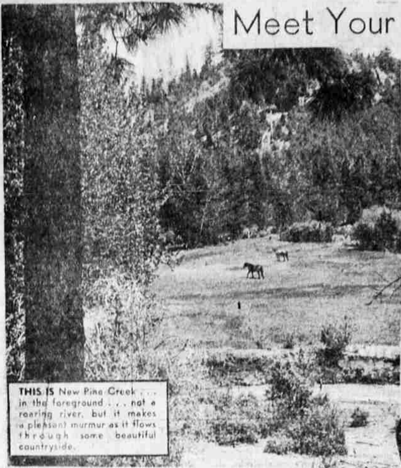
THIS IS New Pine Creek... in the foreground... not a roaring river, but it makes a pleasant murmur as it flows through some beautiful countryside.