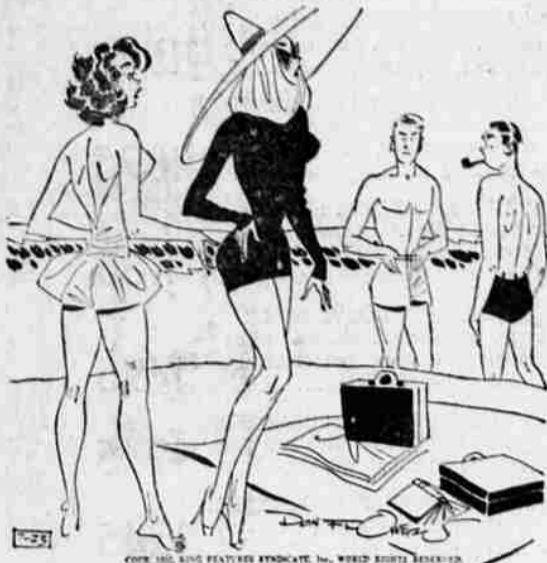
"Don't you think there's such a thing as being TOO mysterious?"