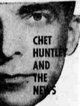
CHET HUNTLEY AND THE NEWS SUNDAYS 8:45 P.M. 1450 KFLW ABC-Radio SPONSORED BY Societe CANDY