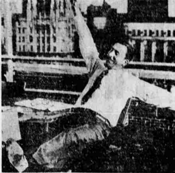
THE LULL BEFORE—Democratic Senator Estes Kefauver of Tennessee relaxes on the roof top of his hotel in Kefauver. He will soon plunge into the fight for the presidential nomination.