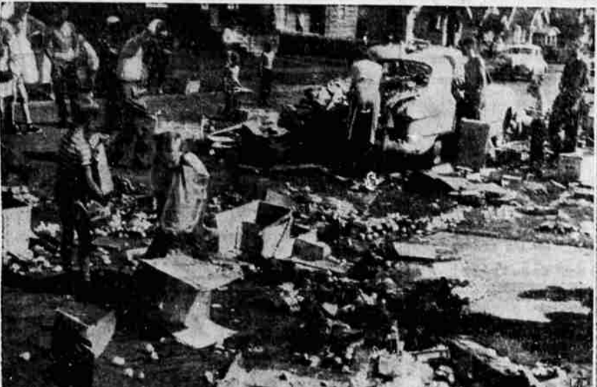
HOW WILL YOU HAVE YOURS?—Here's "eggs-actly" what happened when two trucks, one carrying 1,650 dozen eggs, collided in Seattle, Wash., laying eggs in every form.