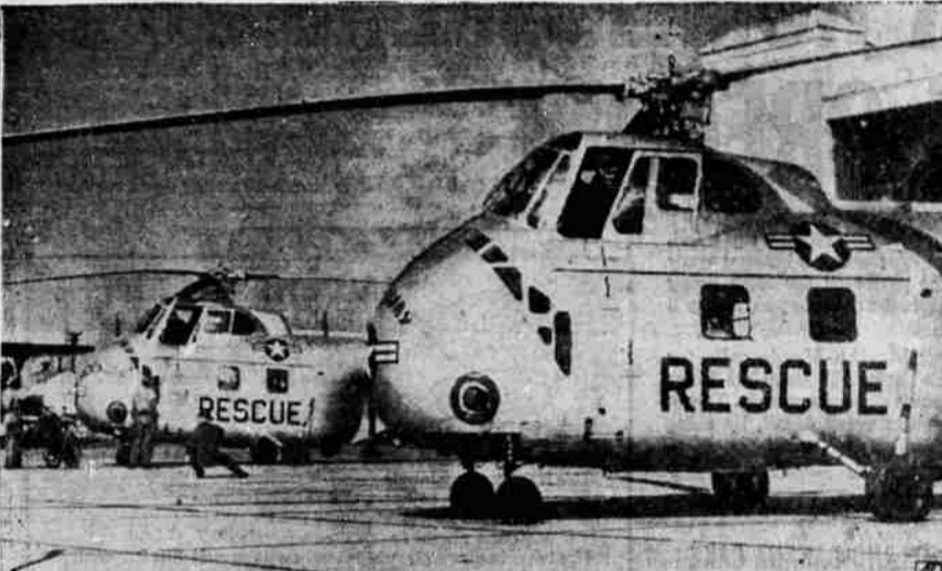
READY FOR ATLANTIC HOP—The two huge helicopters pictured as they were readied for flight, are enroute from Westover Air Force Base, Mass., to Weisbaden, Germany in attempt to make the first helicopter flight across the Atlantic.