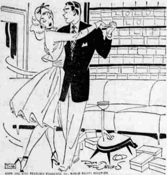
"You dance beautifully in them. What are you doing tonight?"