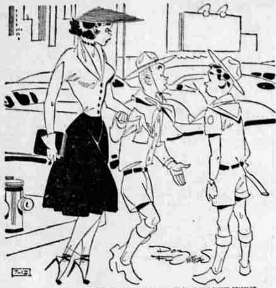
"She's the nearest thing to an elderly lady I could find."