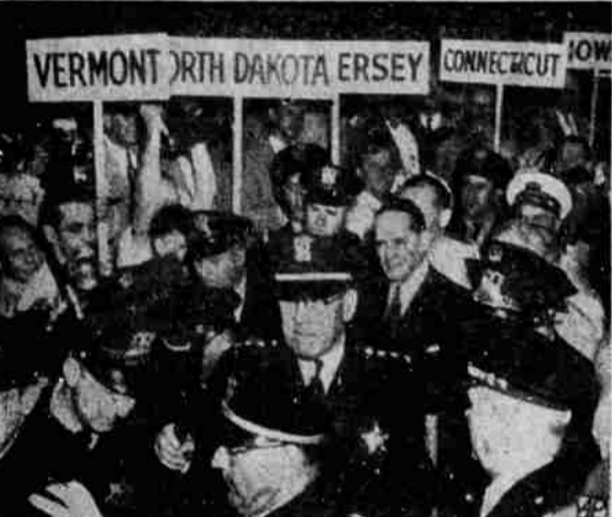
ESCORTED TO ROSTRUM — A squad of uniformed Chicago policemen escorts Gen. Douglas MacArthur to the speaker's stand of the Republican national convention where he delivered the keynote address.