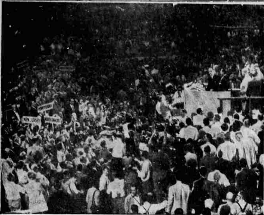
REPUBLICANS CHEER MacARTHUR — Delegates to the Republican national convention stand and cheer Gen. Douglas MacArthur as he stands on the speaker's platform waiting to deliver his keynote speech.